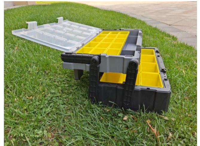
Figure 5. Cantilever Latch Design