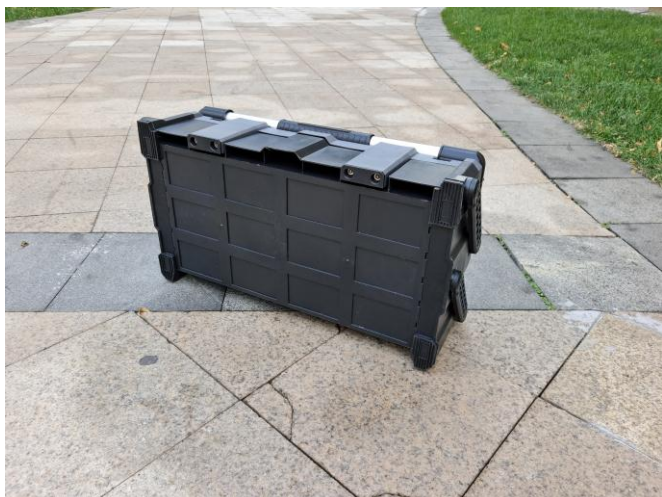
Figure 3. End View