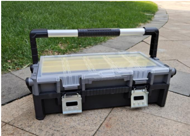
Figure 1. Front View