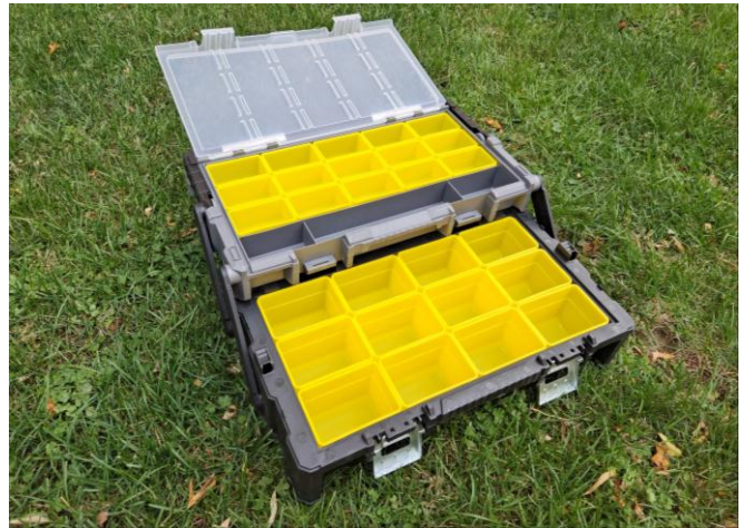
Figure 4. A Trapezoidal Tiered Design