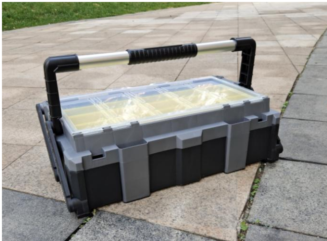
Figure 2. Back View