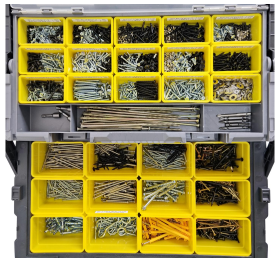
Figure 6. Multi-functional and Retrievable